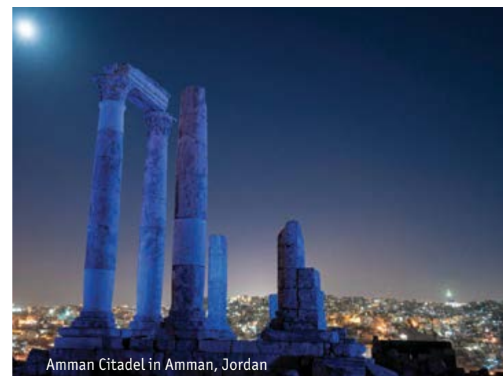
Amman Citadel in Amman, Jordan